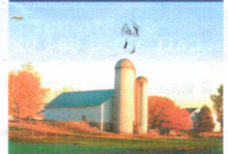
Enjoy the Picturesque Views of Lancaster