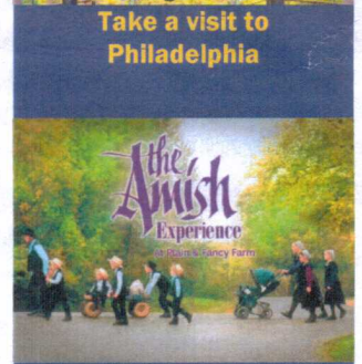
Experience the Amish lifestyle